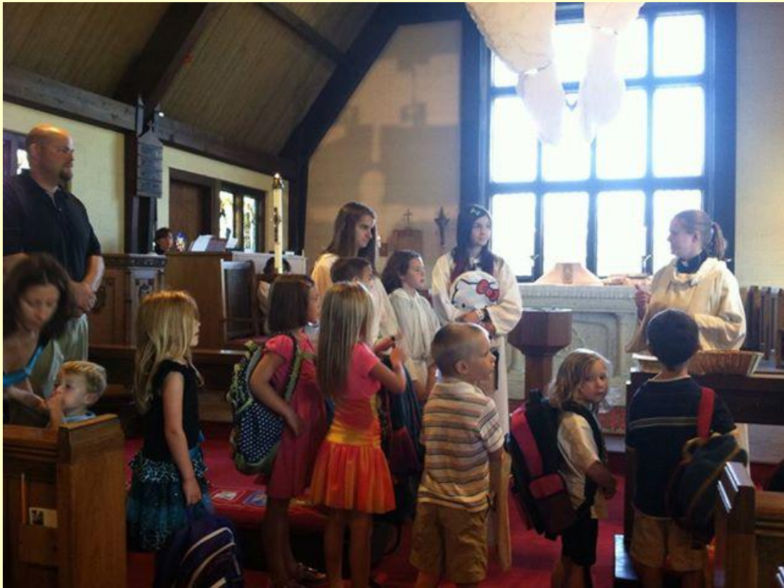
Blessing of Students, Teachers & Backpacks