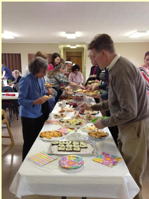
The Bishop's reception spread!